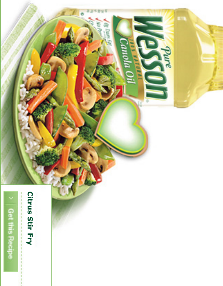
Citrus Stir Fry

● Available in 24oz, 48oz, 48oz, 64oz and 1 gal sizes in retail outlets - grocery, club and convenience stores